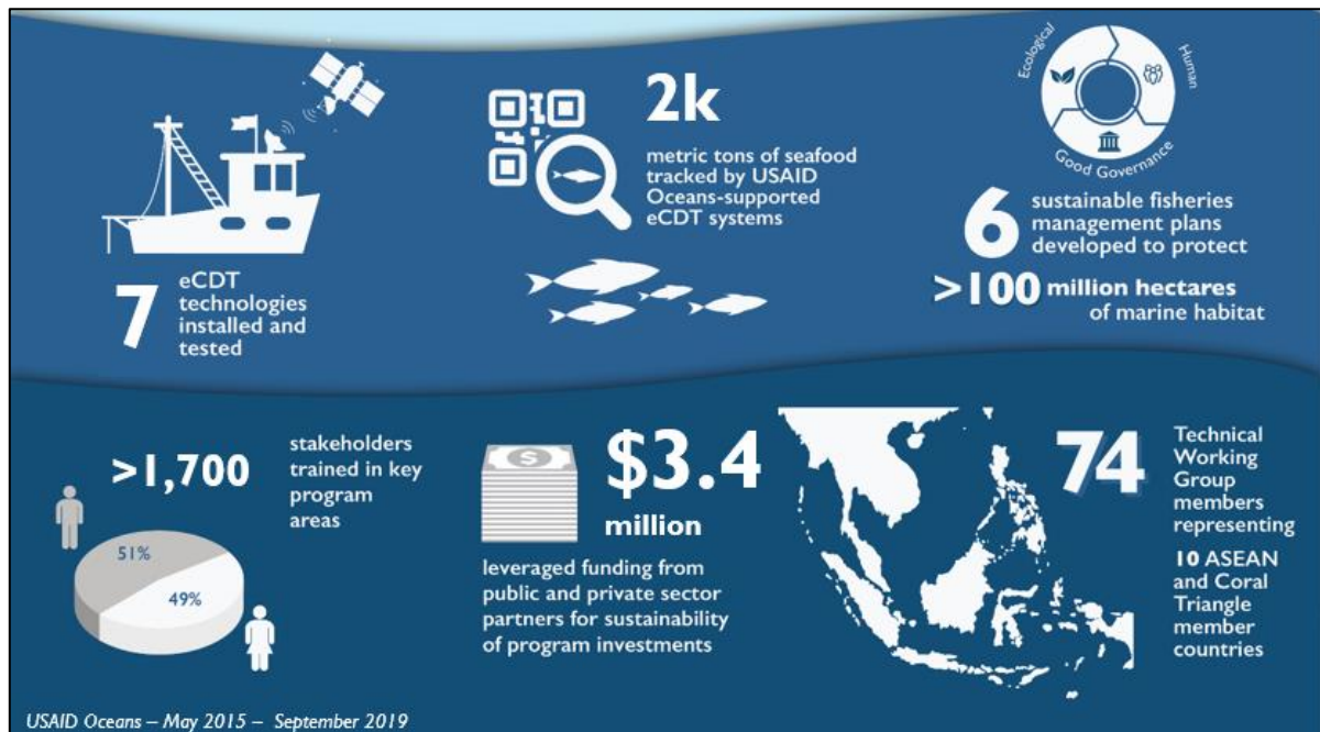
Figure 1. USAID Oceans overall project achievements