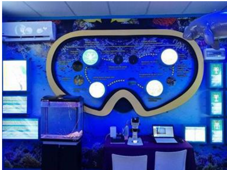
Figure 5. Some information about lobster life cycle on display at the Refugia Information Center in Tanjung Leman