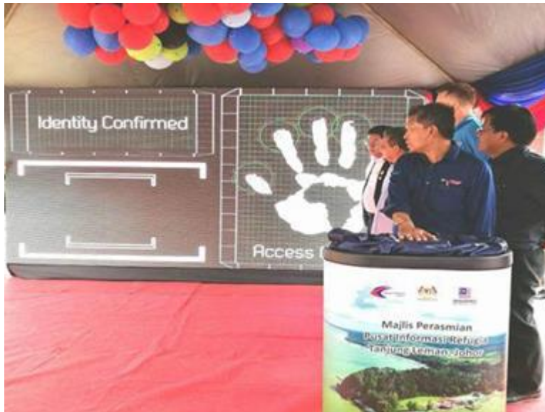
Figure 2. RIC was officiated by the Director General of Department of Fisheries Malaysia on the 20 th of November 2017