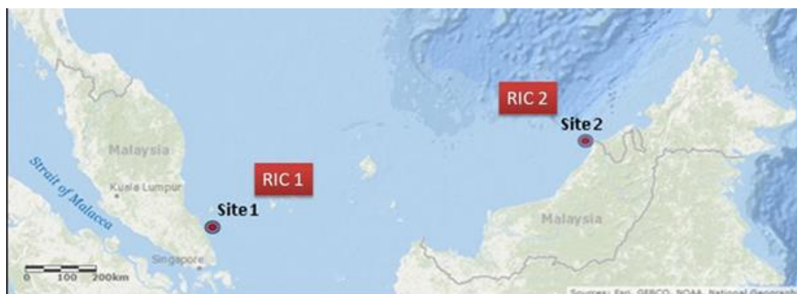
Figure 1. Location of Refugia Information Centers (RIC) in Malaysia. The first site is located at Tanjung Leman, Johor for the Lobster Refugia project while the second site is located at the Miri Fisheries District Office for the Tiger Prawn Refugia project

The Department of Fisheries Malaysia has taken the initiative to establish 2 information centers for the Fisheries Refugia project in Malaysia. The purpose of these Information Centers are to create public awareness and disseminate information about the Fisheries Refugia to the public. The two sites were at i) Tanjung Leman Ferry Jetty at Johor and ii) Miri Fisheries District Office.