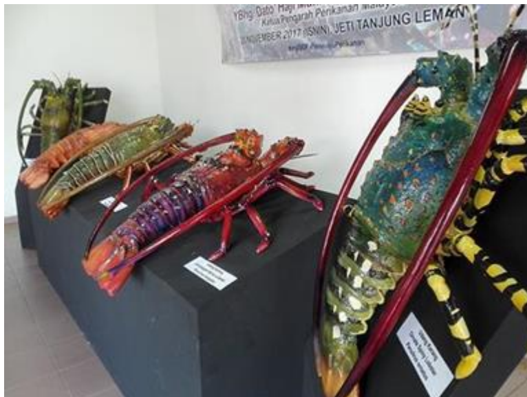
Figure 7. Large and attractive lobster models on display at the Refugia Information Center in Tanjung Leman