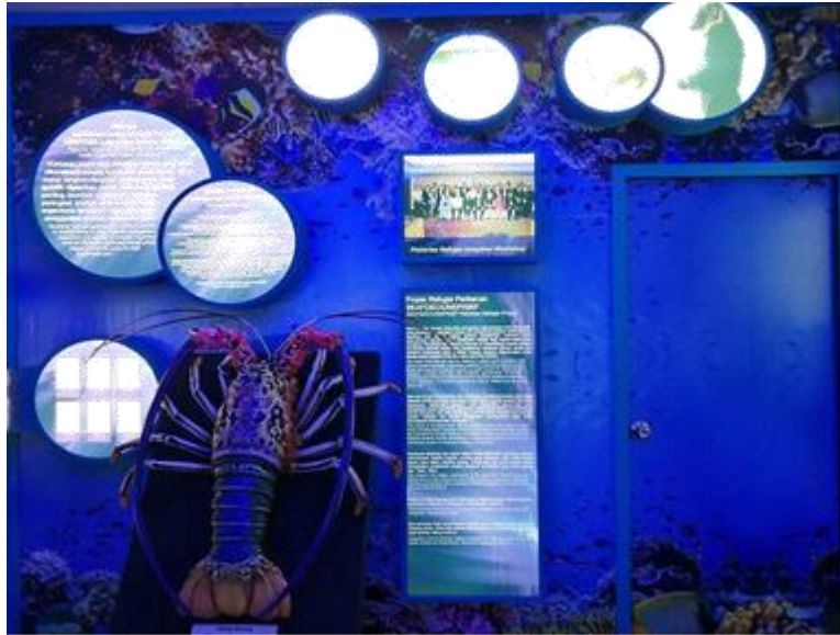
Figure 4. Some lobster information on display at the Refugia Information Center in Tanjung Leman