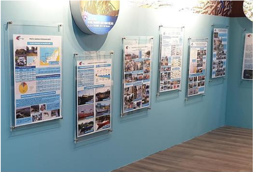
Figure 10. Various posters about Tiger Prawn research and refugia on display at the Refugia Information Center in Miri Fisheries District Office, Sarawak