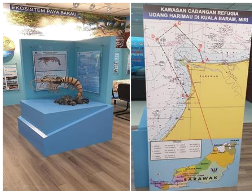
Figure 9. Some information about Tiger Prawn biology and refugia on display at the Refugia Information Center in Miri Fisheries District Office, Sarawak