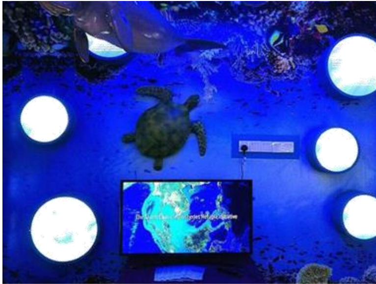
Figure 6. Some related habitat conservation information on display at the Refugia Information Center in Tanjung Leman