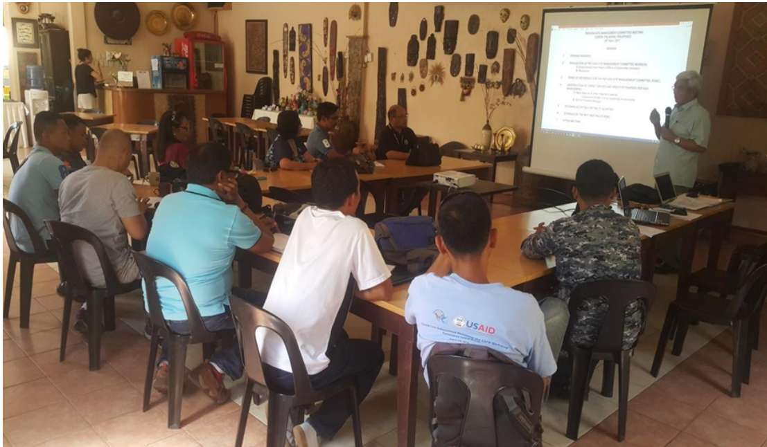
Chief Technical Adviser presenting the Terms of Reference for the Coron Refugia Management Committee