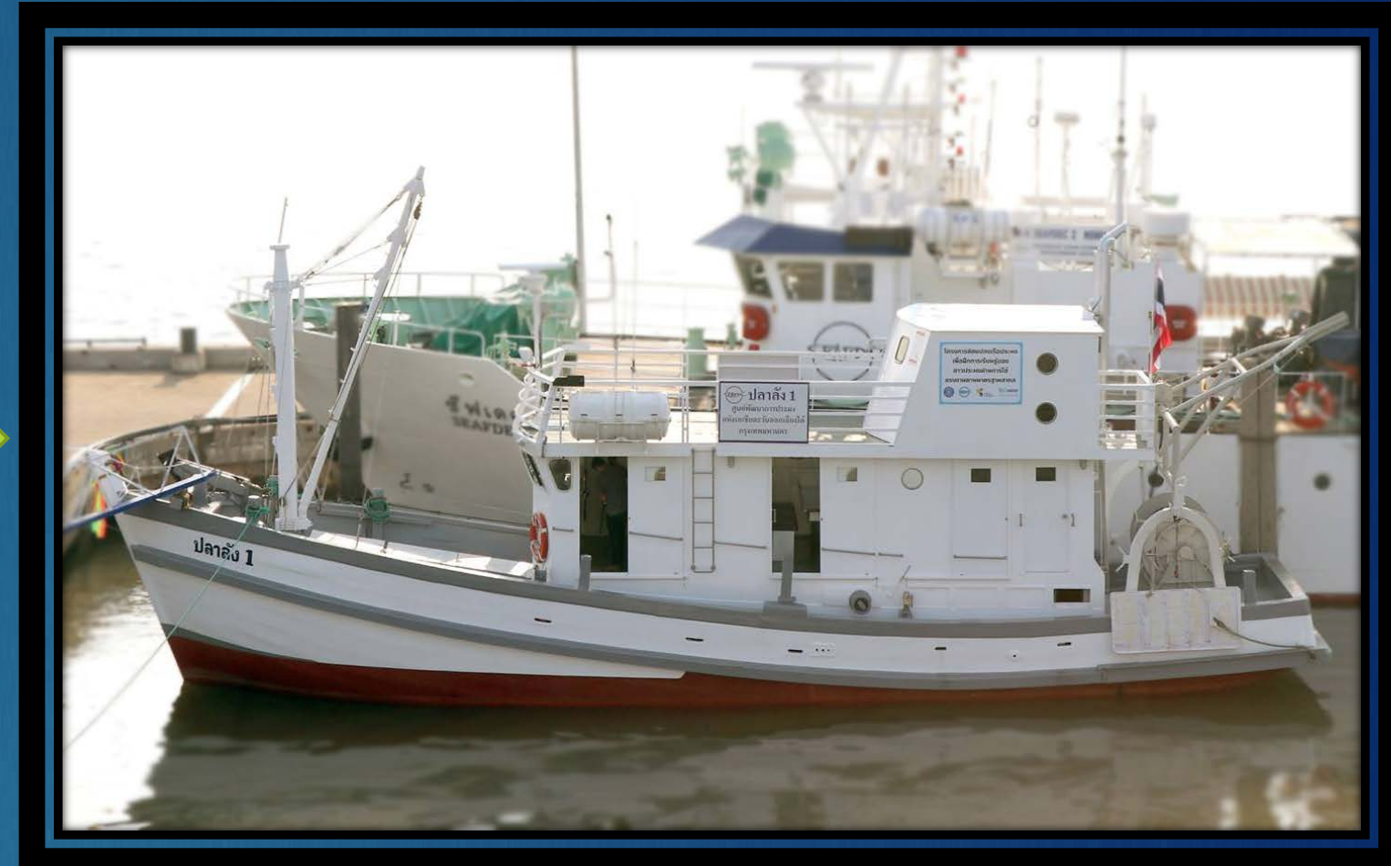
Since 2018 - 2020

Collaboration with Department of Fisheries, SEAFDEC, Nestle and Thai Union to renovation the fishing boat to be the demonstration of the fishing boat based on the convention of ILO (Work in Fishing Convention, 2007)