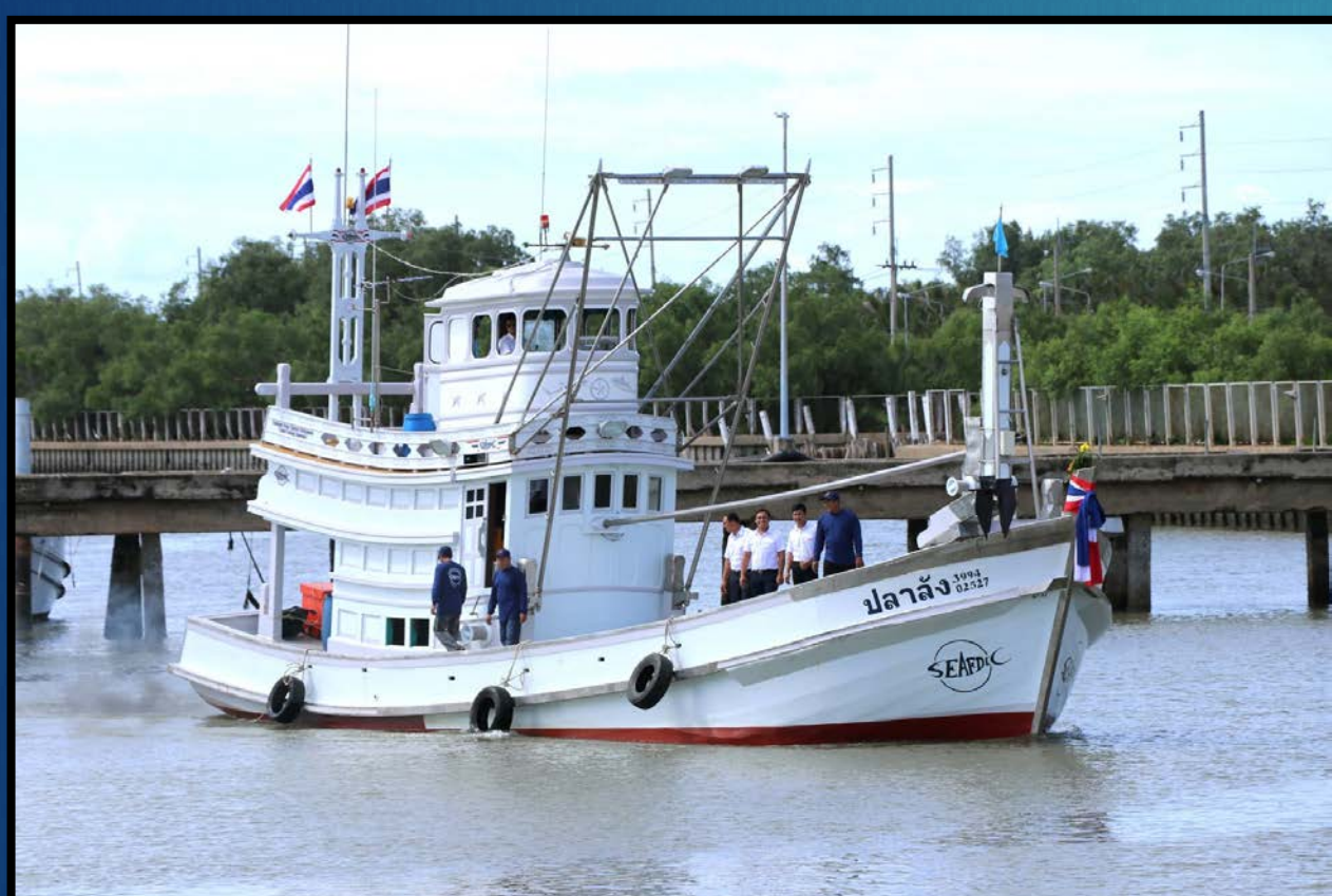
Since 2020 – Present (Under Renovate)

Gross Tonnage : 29.98 GT LOA : 19.00 m. Breadth : 4.67 m. Depth : 2.05 m. Main Engine : Cummins 375 hp.