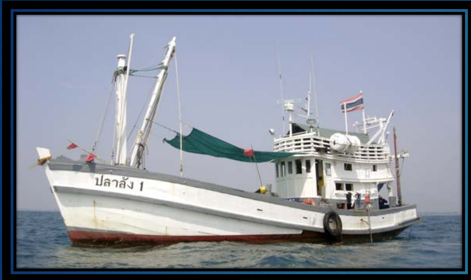
Since 1992 - 2018