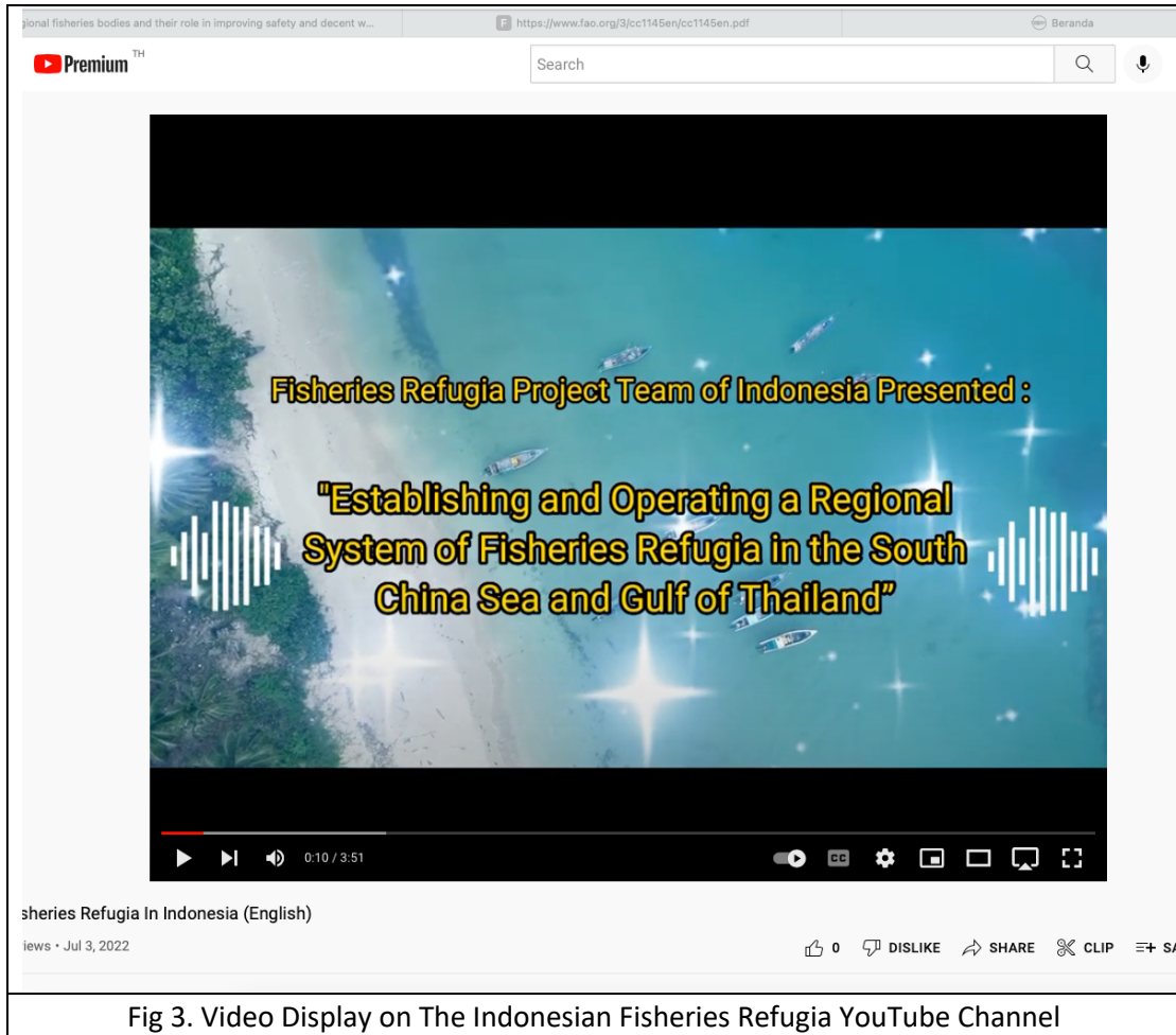
Fig 3. Video Display on The Indonesian Fisheries Refugia YouTube Channel