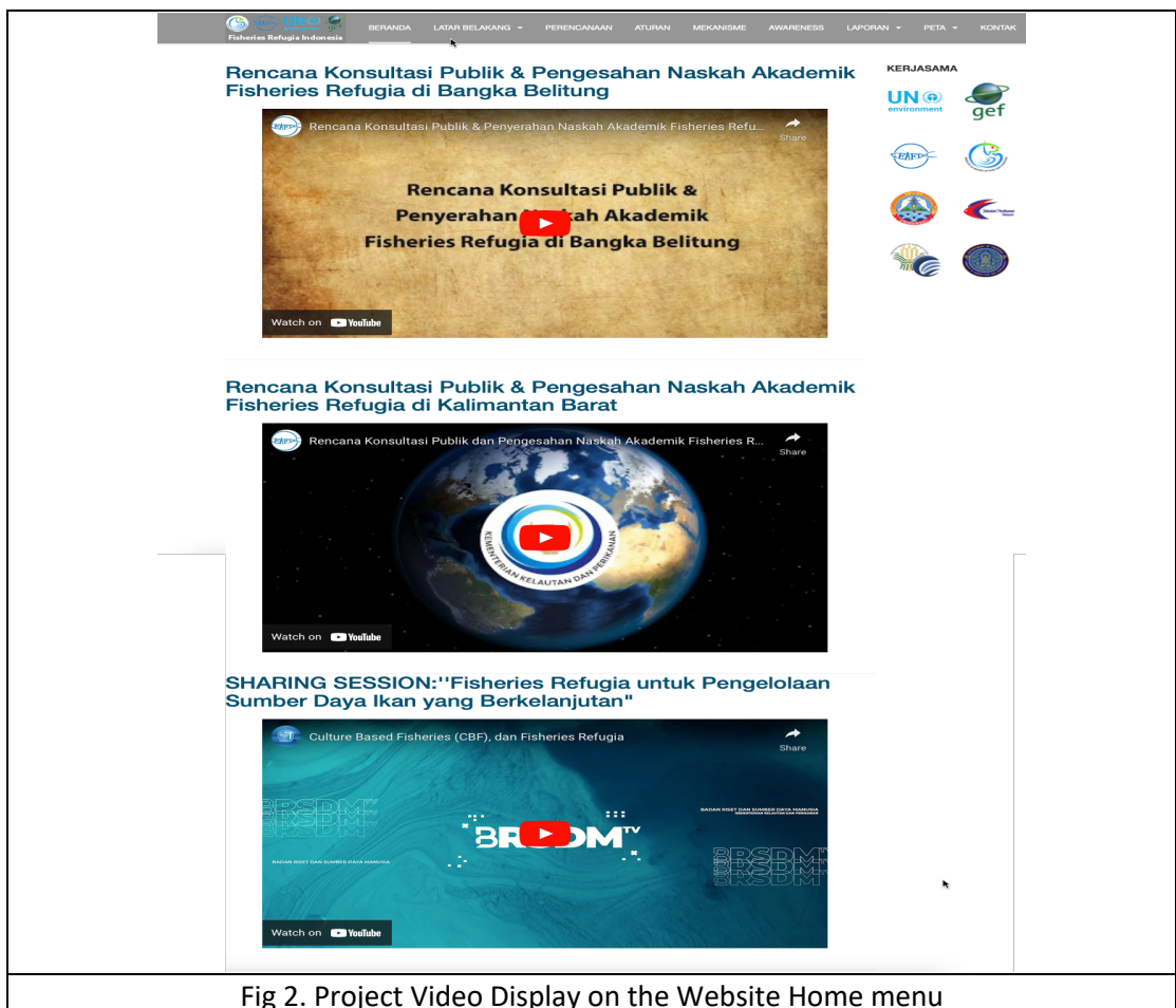
Fig 2. Project Video Display on the Website Home menu