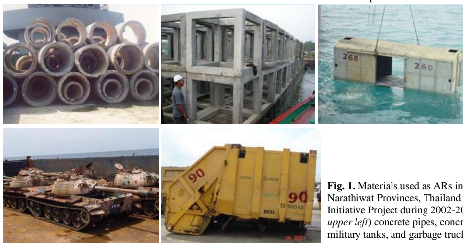
Fig. 1. Materials used as ARs in Pattani and Narathiwat Provinces, Thailand under the Royal Initiative Project during 2002-2014: (clockwise from upper left) concrete pipes, concrete blocks, train cars, military tanks, and garbage trucks

The materials used as artificial reefs (ARs) are shown in Fig. 1 , while Table 1 shows the number of materials that have been used as ARs in these provinces.