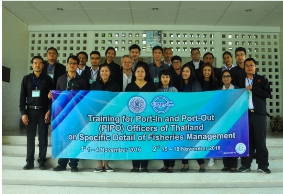
Trainees, Observers and Trainers of The 1 st training course on 1 – 4 November 2016