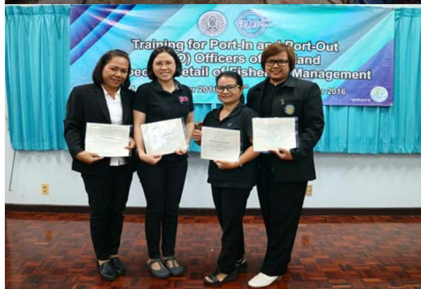
Picture: The activities during the training course at Songkhla Province