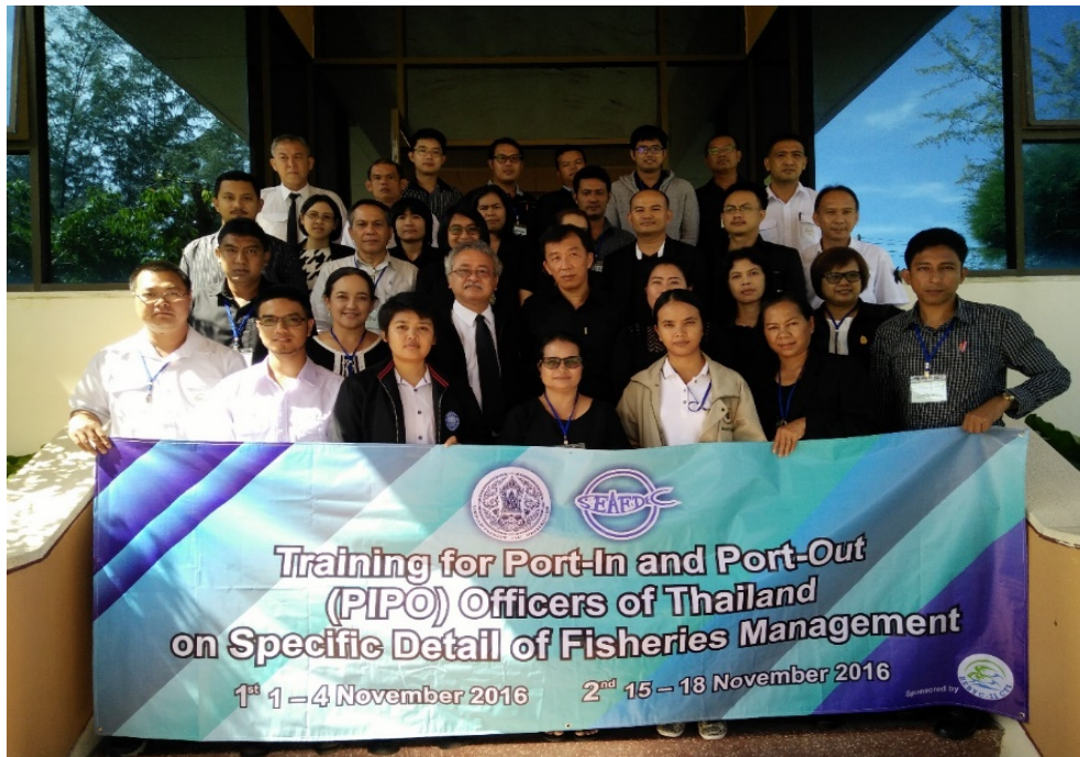
Trainees, Observers and Trainers of The 2 nd training course on 15 – 18 November 2016