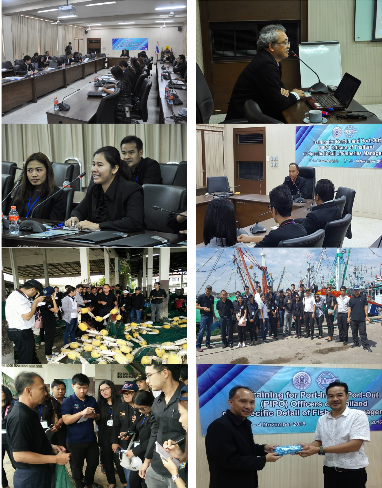
Picture: The activities during the training course at Rayong Province

Photo of the activities during both training courses in Rayong and Songkhla Province.