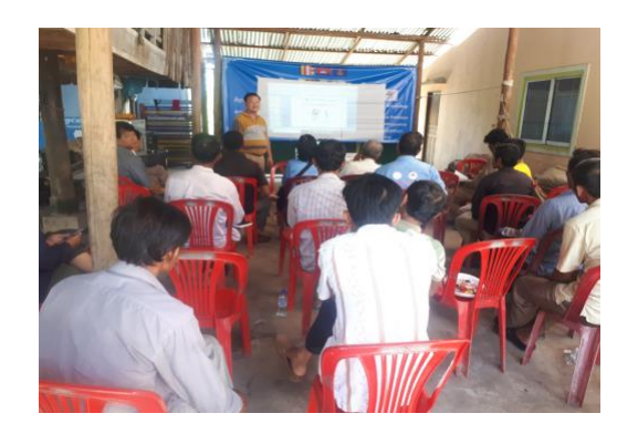
ANNEX 3 Participants' Pictures in Stakeholder Consultation Workshop for Fisheries Refugia with community fisheries on 12 to 13 November 2018 at Kampot province