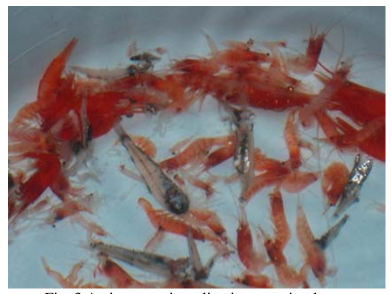
Fig. 3 Active organisms live in scattering layer