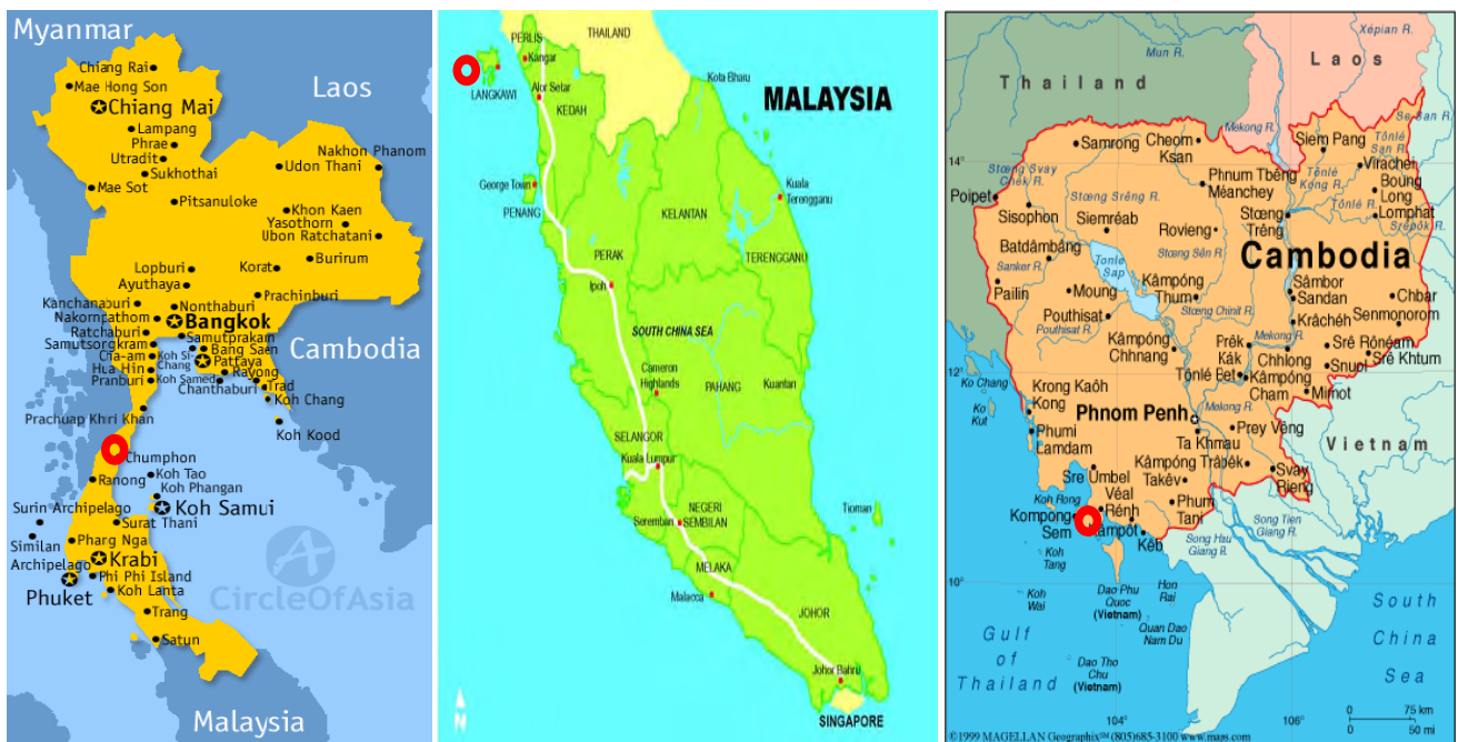
● The ICRM pilot projects implemented by SEAFDEC in Thailand (Pathew District, Chumphon Province: ICRM-PD), in Malaysia (Pulau Langkawi: ICRM-PL), and in Cambodia (Sihanoukville: ICRM-SV)

While the ICRM-PD project in Chumphon was terminated in December 2006, the ICRM-PL project in Langkawi, Malaysia had also progressed but was disrupted on 26 December 2004 when the devastating tsunami damaged the project operational area in Langkawi. Most fishing gear and boats were destroyed or lost, and the fish landing facilities were ruined. Thereafter, the project orientation was changed in order to focus on the rehabilitation of the area including repair of the fishing fleet. In order to pursue the remaining activities based on the original objective, the project for another three years until December 2007. With the main focus of the project activity in 2005 and 2006 placed on the rehabilitation of the fishing fleet and fishery facilities damaged by the tsunami, it was only toward the end of 2007 that the fishing activity had more or less resumed as it was in 2004 before the tsunami. Consequently, the project activities which have also normalized in early 2007 had to be terminated in December 2007 with the final project evaluation conducted in March 2008. Meanwhile, the project ICRM-SV in Sihanoukville, Cambodia, has been extended for another year until the end of 2009 to complete the on-going activities in connection with coastal fishery resources management practices following the community development approach.