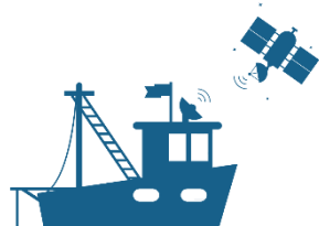
Inmarsat Fleet One Technology