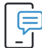
Xsense Hi-Chat Application

The pilot employed Inmarsat's Fleet One VMS technology with two-way communication, an electronic logbook (eLogbook), and a mobile phone application developed by Xsense. At sea, the Inmarsat Fleet One technology enabled the vessel captain and crew to capture and transmit key traceability data elements through broadband connectivity and the eLogbook application. The eLogbook, used onboard through a tablet, allowed real-time reporting of catch data that could be transferred to Thai Union's existing, internal traceability systems that capture data throughout the supply chain. The mobile crew communication application, called Hi-Chat, enabled ship-to-shore crew communication so that workers at sea could communicate with family members and emergency personnel.