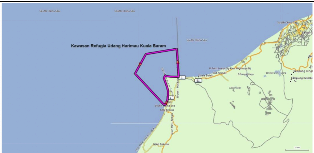
Figure 1: Proposed site purple line for the fisheries refugia of tiger prawn ( Penaeus monodon ) in Kuala Baram, Sarawak