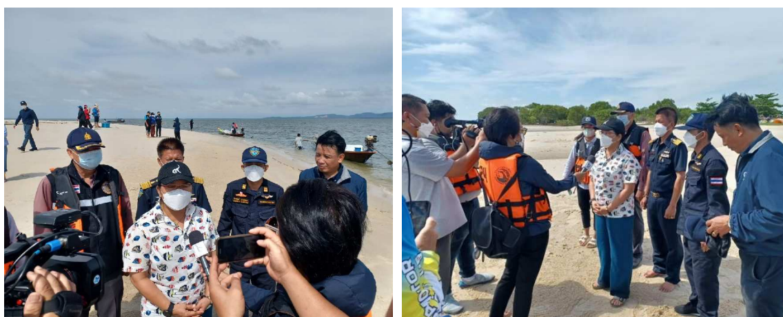
Figure 6 Press interview for establishment and operation of fisheries refugia at Surat Thani Site