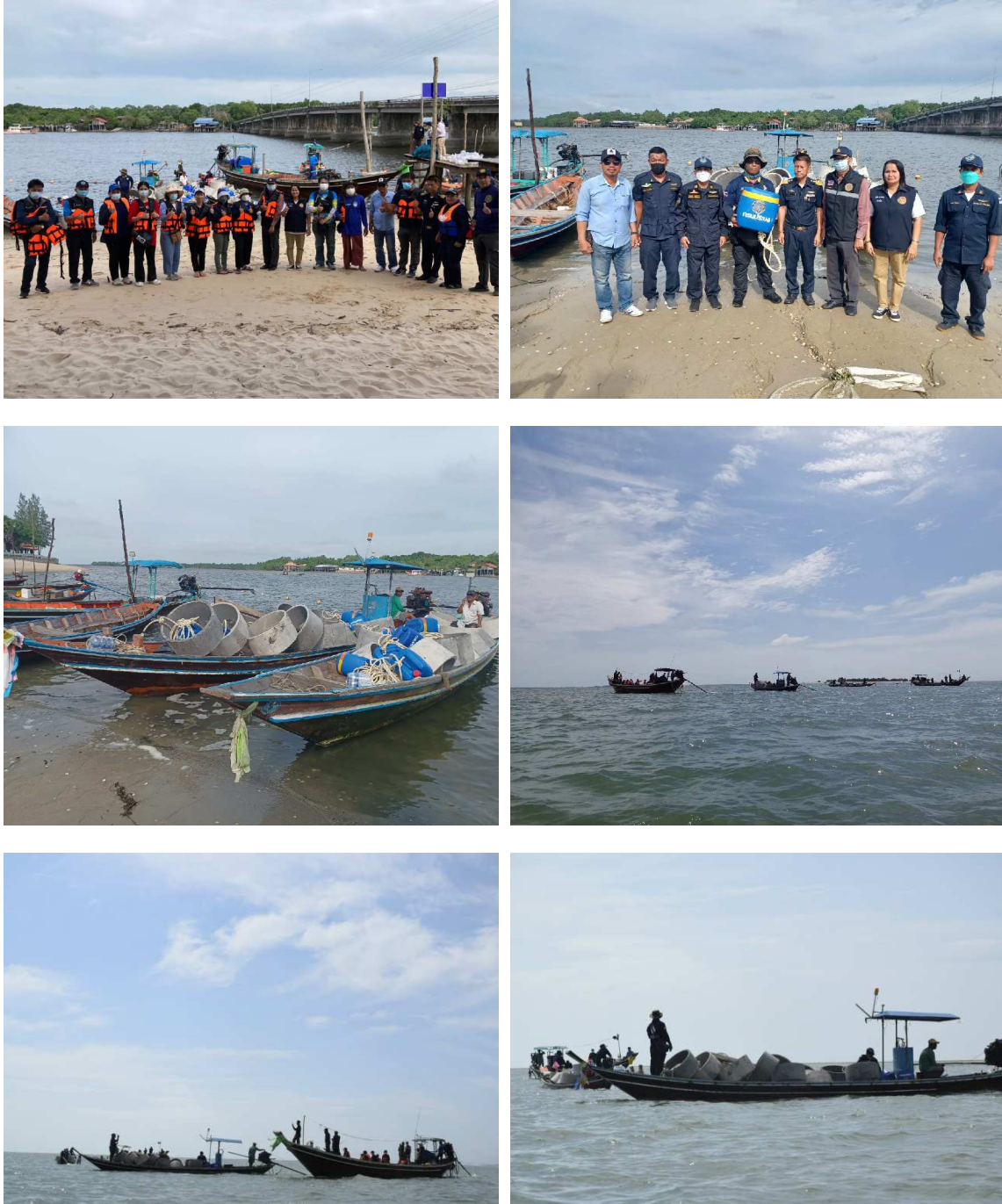
Figure 5 Activities for fisheries refugia boundary marking at Surat Thani Site