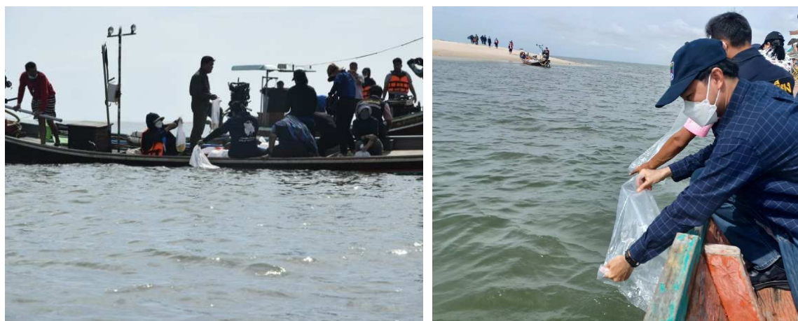
Figure 3 (cont.) Activities for seed releasing at Surat Thani fisheries refugia site