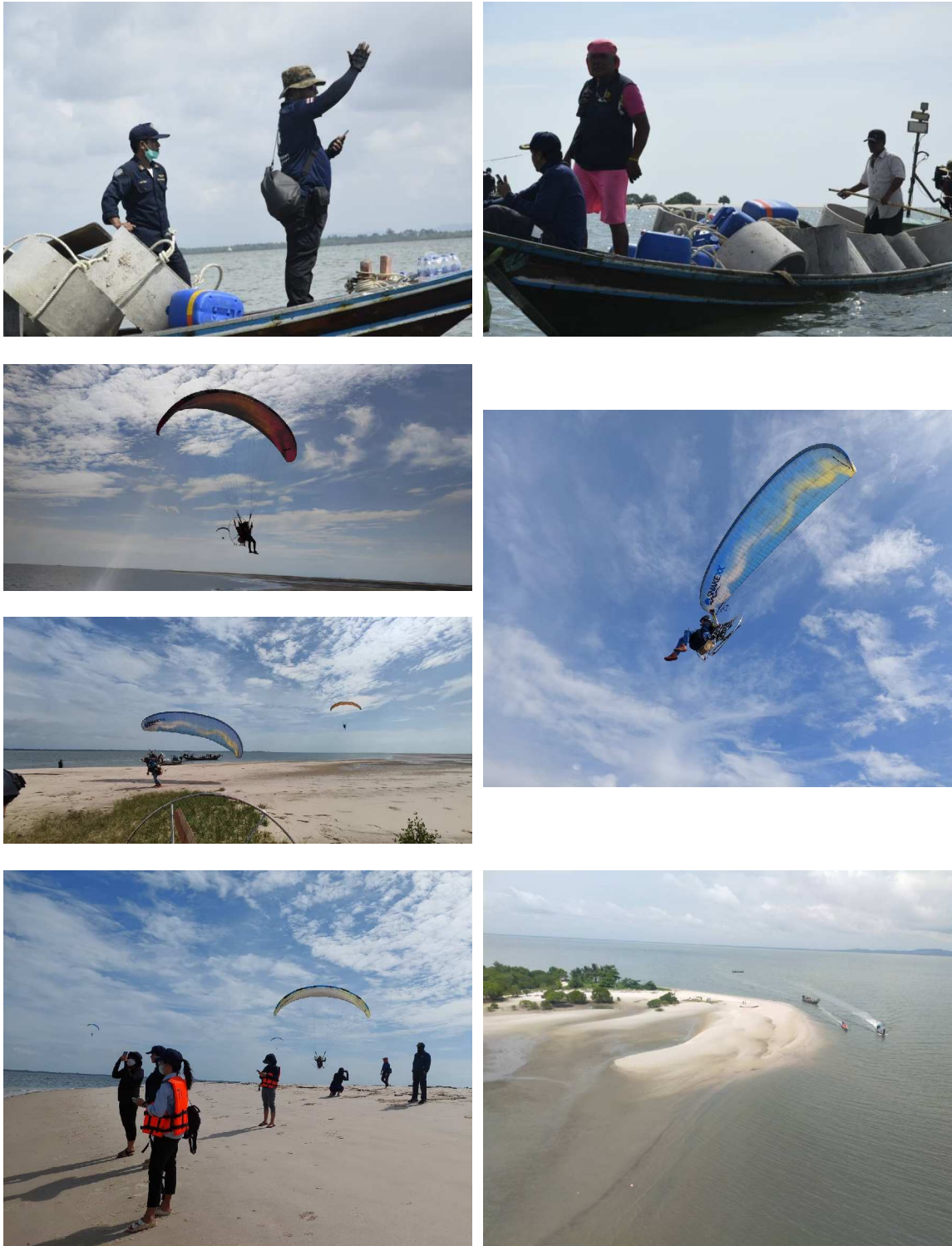
Figure 5 (cont.) Activities for fisheries refugia boundary marking at Surat Thani Site