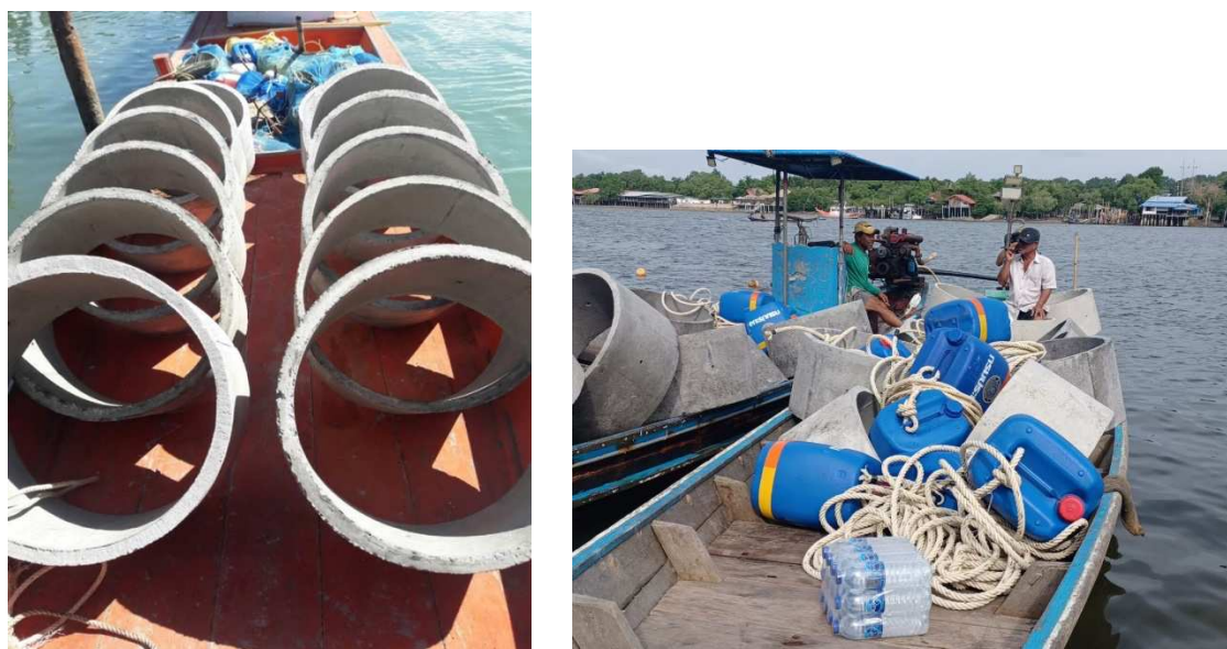
Figure 2 Sinkers, buoys and connecting ropes prepared for fisheries refugia boundary marking at Surat Thani Site

A concrete pipe, 80 centimeters in diameter and 40 centimeters in depth, was used as a sinker for each buoy. A buoy and a sinker were connected together by a 12-meters polypropylene rope, 18 millimeters in diameter. Concrete sinkers and connecting ropes can be seen in Figure 2.