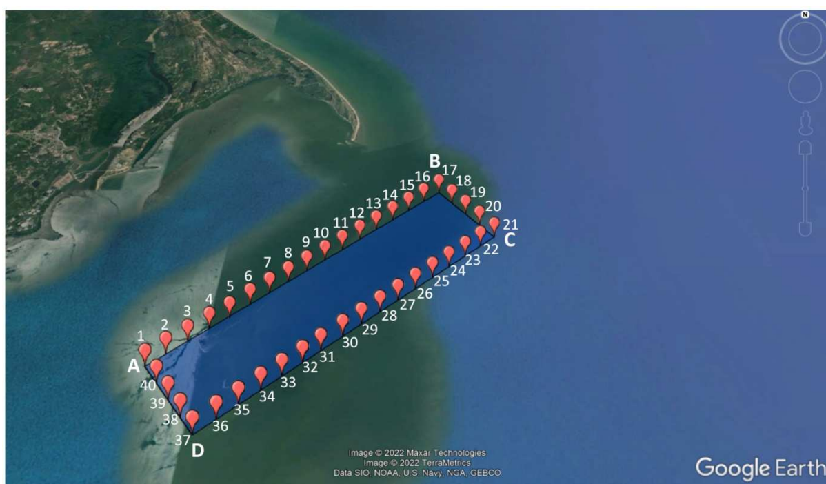
Figure 4 Fisheries refugia boundary and its buoy-marking points at Surat Thani Site

For thorough involvement, 4 boats were provided for the rest of participants and local reporters to observe activity at sea. They also got ashore at Koh Sed to observe the topography and coastal resources. Along with recording on ground, the activities were aerial recorded as images and videos, by drone and on paramotrs. Activities for fisheries refugia boundary marking are shown in Figure 5.