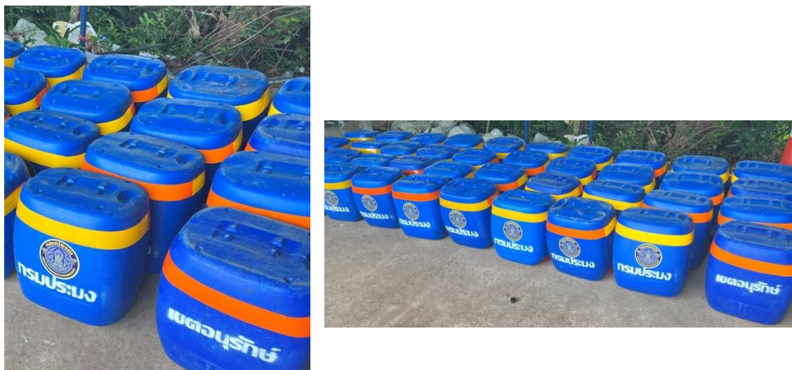
Figure 1 Buoys for fisheries refugia boundary marking at Surat Thani Site

The buoy is made of 30-liter polypropylene bucket, filled with polyurethane foam. Logo and the name “Department of Fisheries” was water-proofed spray painted at one side of the buoy while “Conservation Area” was painted at the opposite side. Reflective stripe was placed at its upper side. The total of 40 buoys was prepared for boundary marking. Ready-prepared buoys are shown in Figure 1.