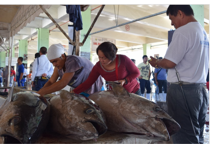
Tuna is weighed and classified at the General Santos Fish Port Complex as brokers assess the day's catch.

Most fishers borrow starting capital from financiers and often sell their catch back to the financier, who is also a consolidator and then a wholesaler. All players relate to each other in the pervasive and high trust "suki" system – driven in part by their residence in the same community, by the willingness of financiers to wait for their payment, and eventually, by the indebtedness or "utang na loob" inherent