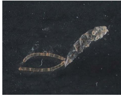
Fig 3. Eudactylina sp. (Female)

One genus of copepoda, Eudactylina sp. found in gill. It is the external parasite.