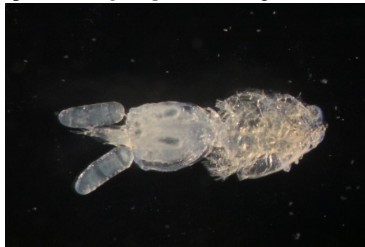
Fig 6. Caligus sp.

One genus of arthropoda, Caligus sp. found in gill. It is the external parasite.