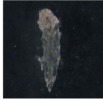
Fig 4. Eudactylina sp. (Male)