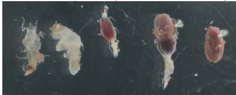
Fig 5. Gnathia sp.

Gills sometimes infested by larval isopods (Praniza-larva of the isopod Gnathia ).