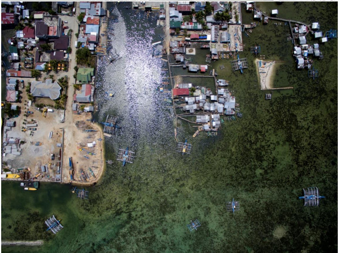
Aerial Photo of Municipal landing Site at Bolinao, Pangasinan