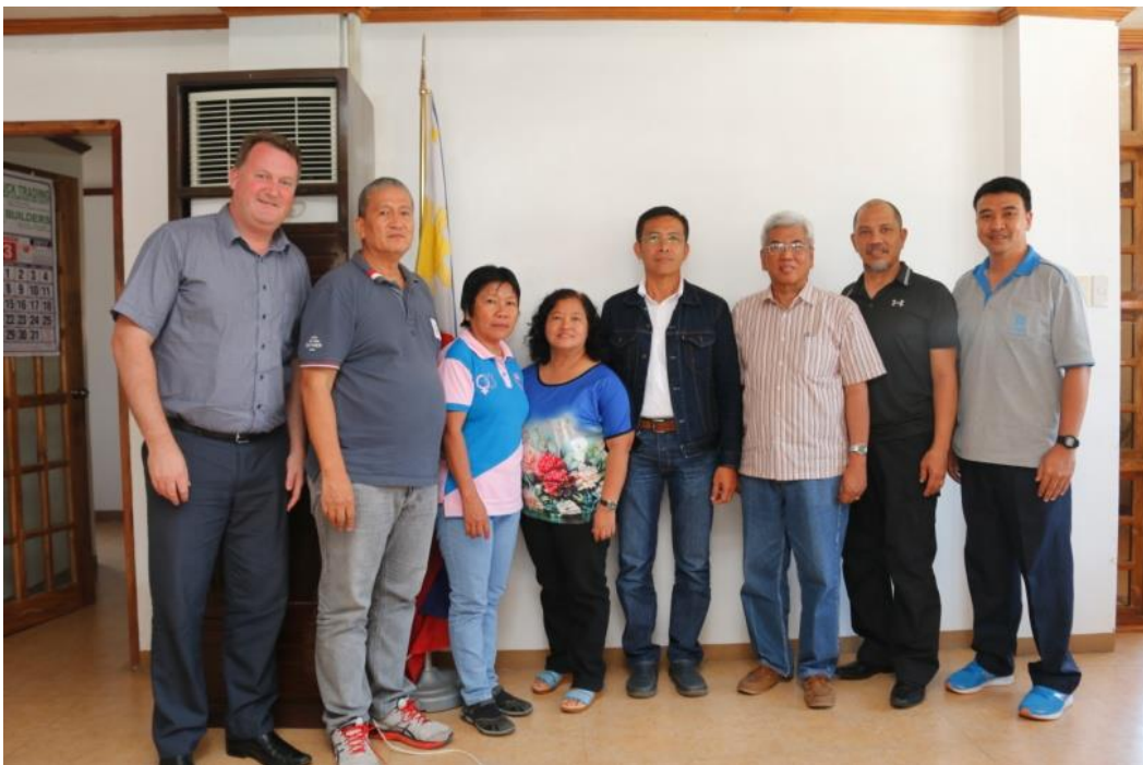
Group Photo after the Orientation Seminal of Fisheires Refugia Project