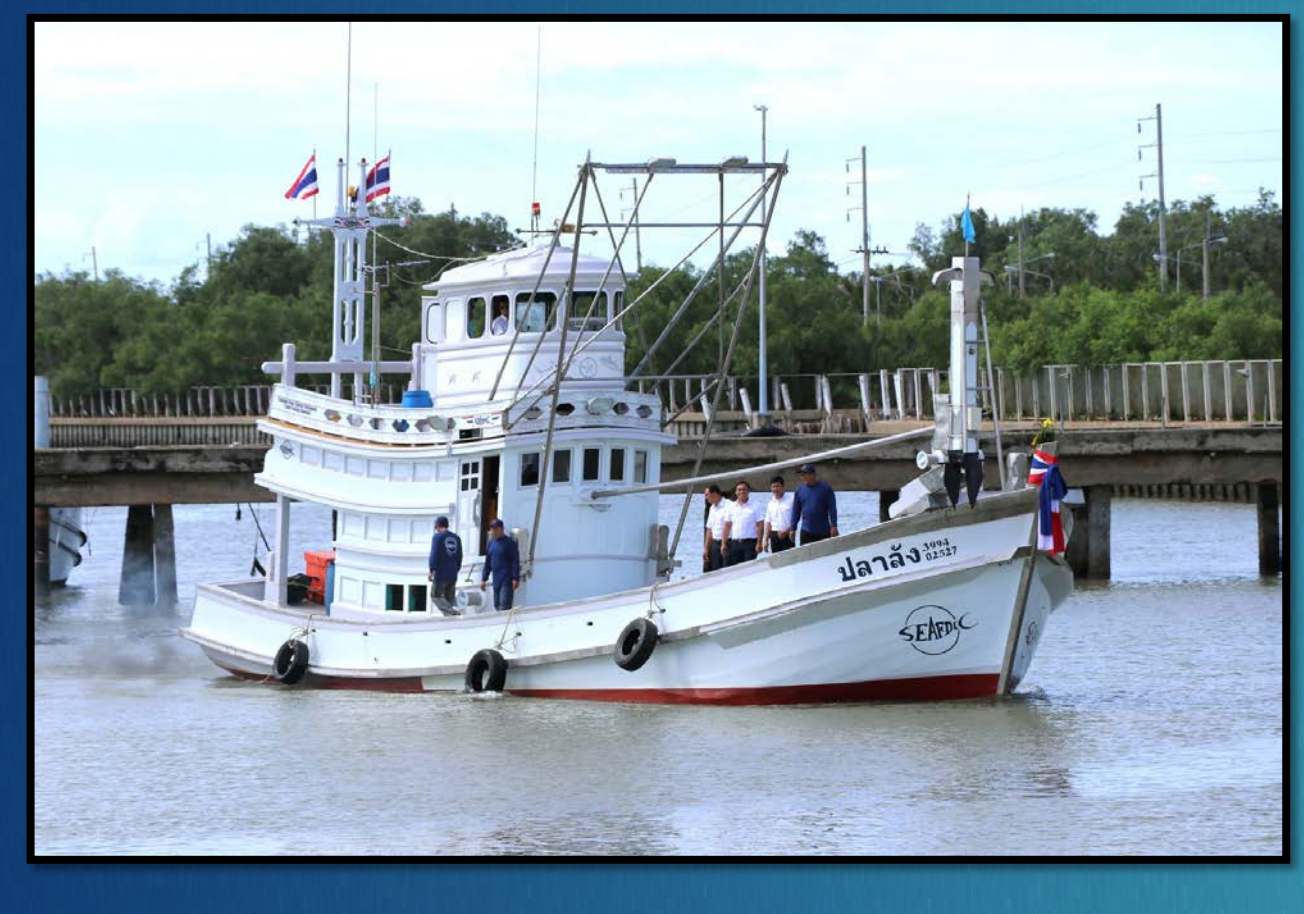
Since 2020 – Present (Under Renovate)

Work in Fishing Convention (2007) C 188, was adopted at the 96th International Labour Conference (ILC) of the International Labour Organization ILO in 2007. The objectives of the Convention is to ensure that fishers have decent conditions of work on board fishing vessels with regard to minimum requirements for work on board; conditions of service; accommodation and food; occupational safety and health protection; medical care and social security. It applies to all fishers and fishing vessels engaged in commercial fishing operations. It supersedes the old Conventions relating to fishermen.