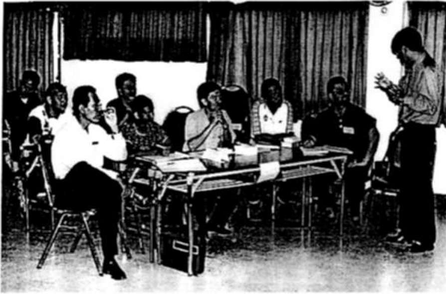
Studying in the lecture room