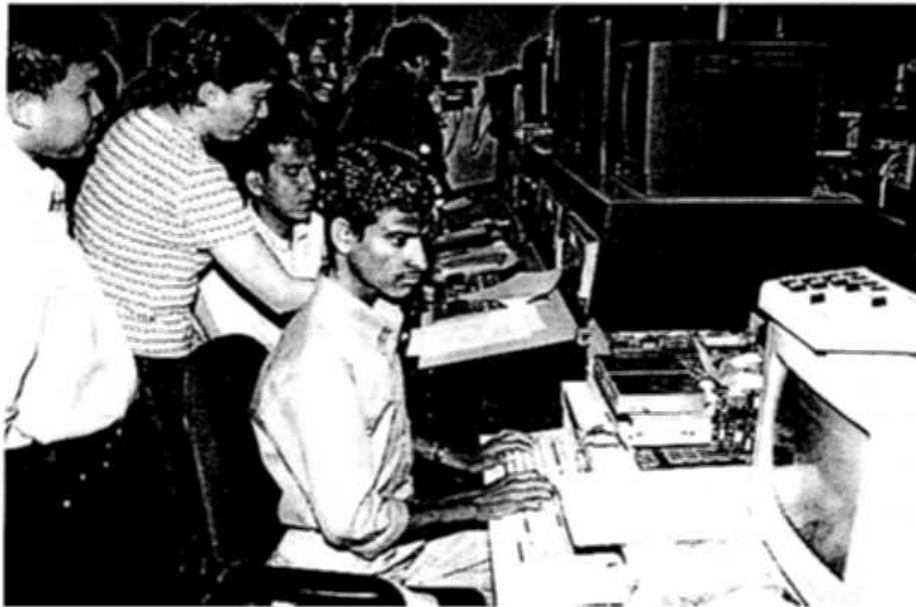
Practicing Audio-Visual Media Production