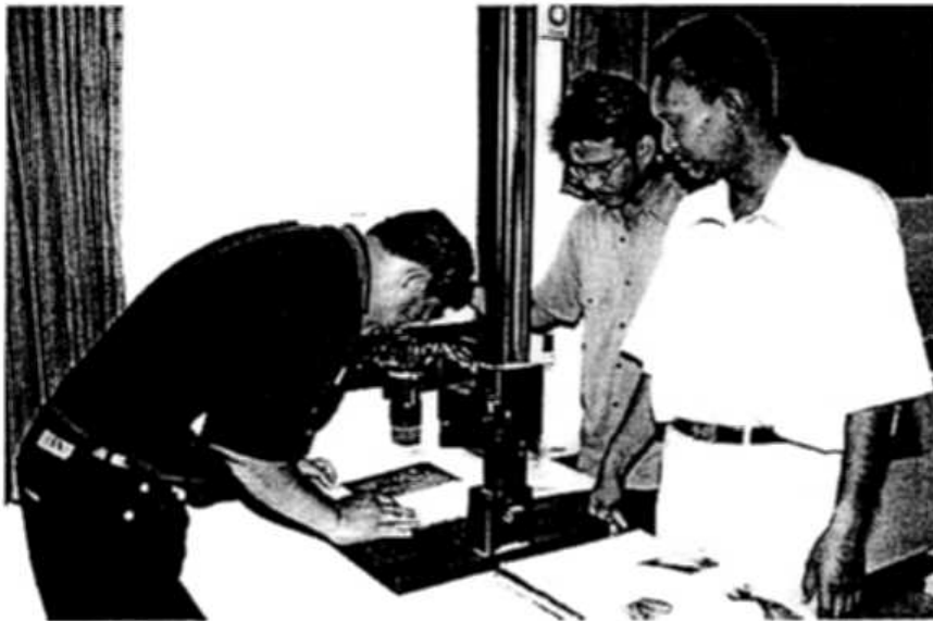
Practicing Media Production