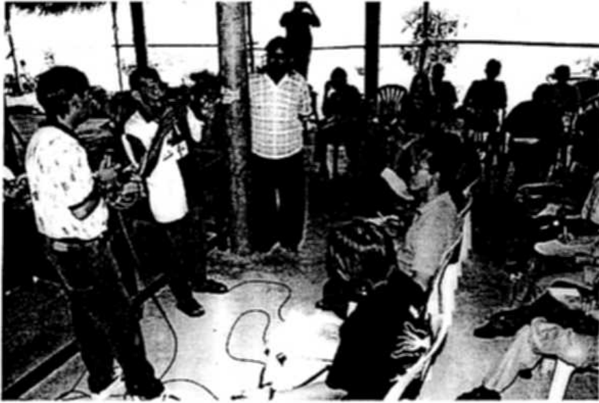
Group Discussions with fishermen during a field trip