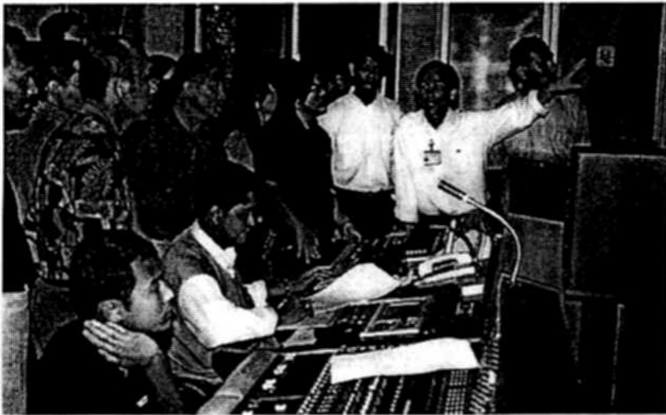
Visiting the Production Section of Television Station Channel 7