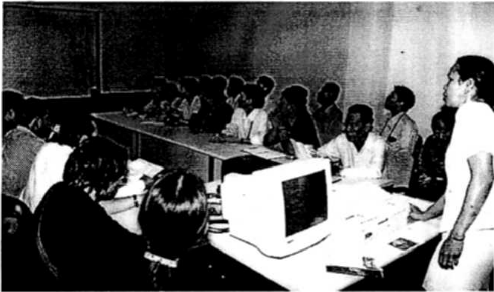
Visiting the Computer Section of Sukhothai Thamatirath Open University