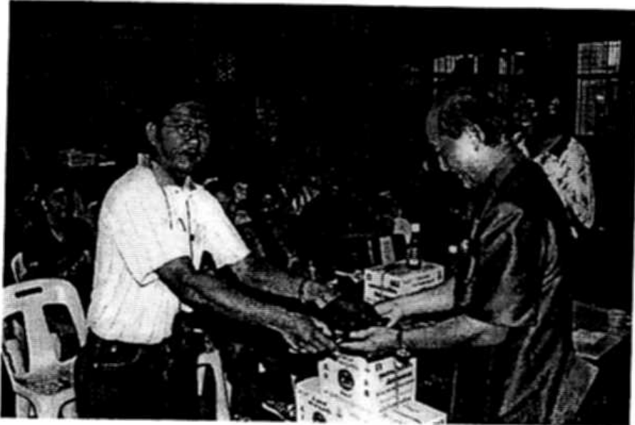
Visiting Fish Sauce Factory